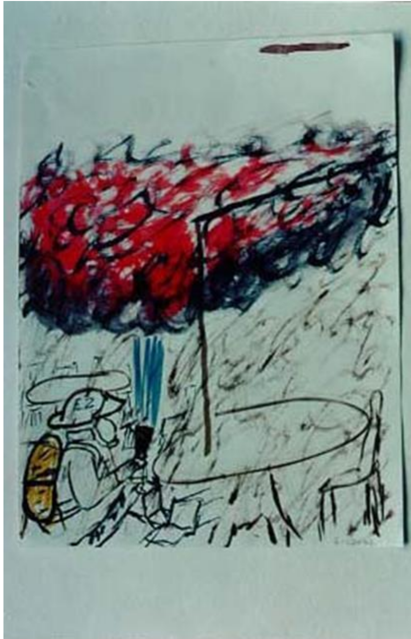
Figure 3. Helpful Characters in the Fantasy Kingdom

triangles can be used. You can also make a 3-D Play Doh or paper mache sculpture of a guardian spirit or a protective character (see Figure 5).