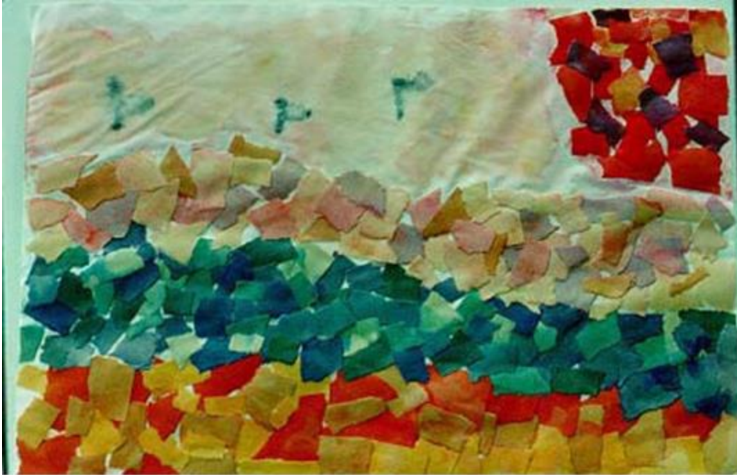
Figure 4. Making a Picture by Tearing Up and Gluing Pieces of Paper