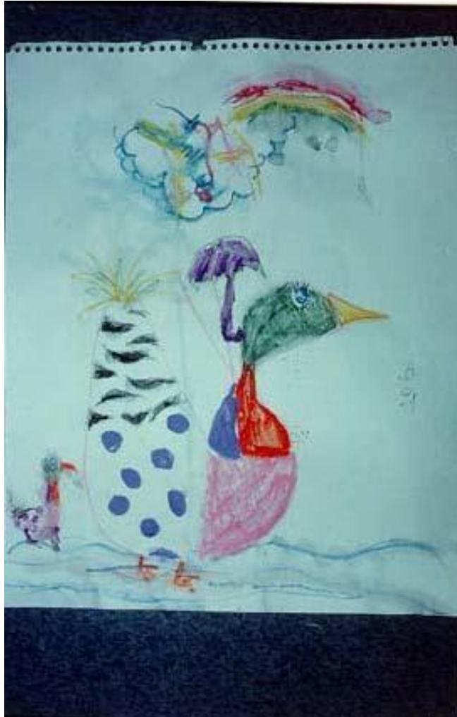
Figure 2. A Once Upon a Time Fairy Tale Drawing or Painting

kingdom where there was a hurricane (flood, earthquake, etc.)” and then let your child fill in the rest of the story by drawing or painting images of what your child thinks happened in this kingdom. Encourage your child to put animals and imagined or real characters in the drawing or painting.